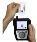
Step 4– Insert Card